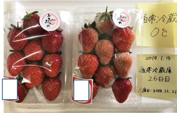
Day 26 th