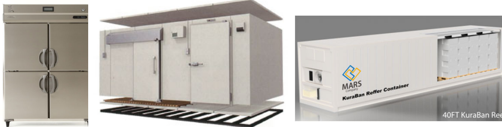
Kuraban lineups (refrigerator)