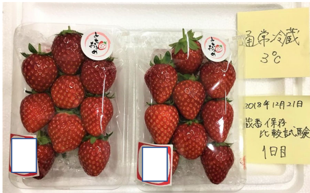
Day 1 st

Test result (Conventional refrigerator at 3°C → Last one week at 0°C)