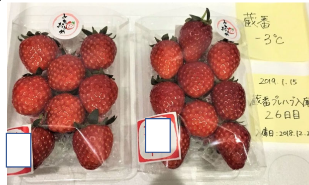
Day 26 th