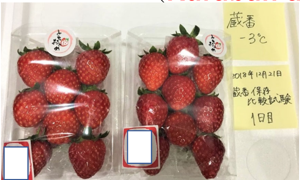
Day 1 st