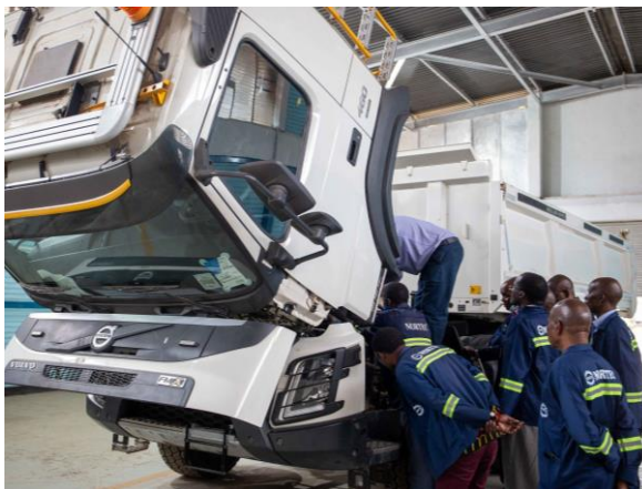
ONSITE TRAINING OF TRAINERS