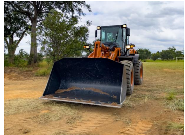
TRAINING OF YOUTH IN ZAMBIA