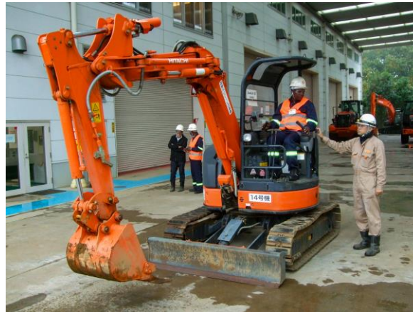
TRAINING OF TRAINERS IN JAPAN