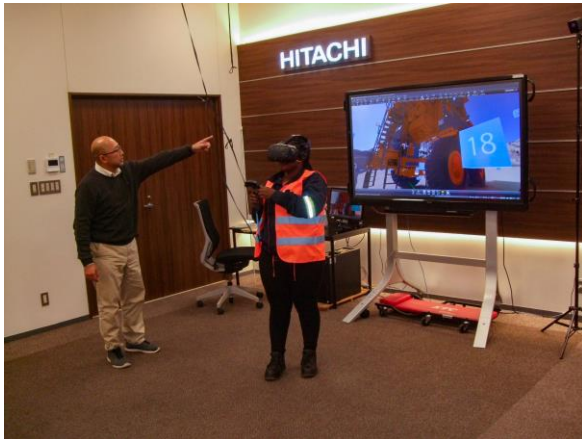
STUDY TOUR IN JAPAN