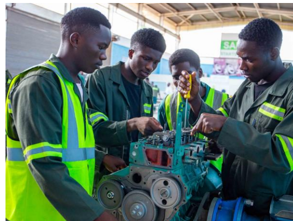
HANDS-ON TRAINING FOR YOUTH