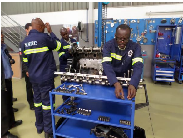
OVERSEAS TRAINING OF TRAINERS