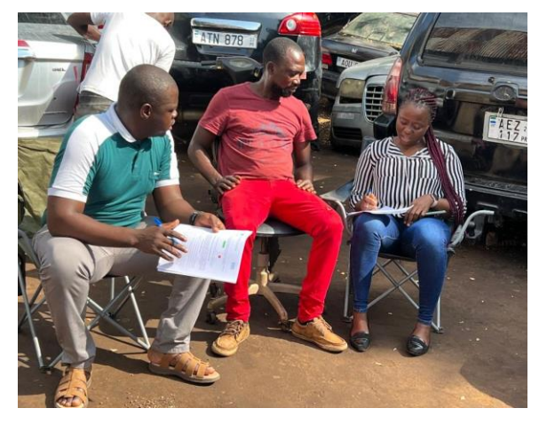
Project field staff conduct pilot test on TNA survey tool